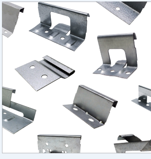
GALVALUME & STAINLESS STEEL CLIPS