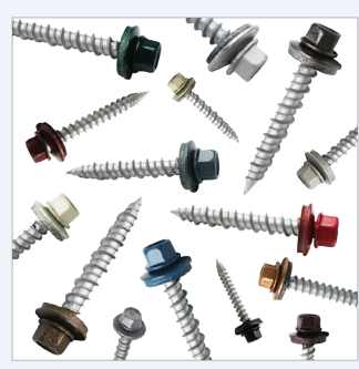
CARBON STEEL & STAINLESS FASTENERS