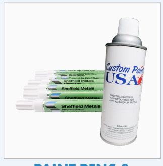
PAINT PENS & TOUCH-UP PAINT