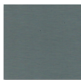
elZinc Rainbow® Blue