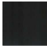
elZinc Rainbow® Black