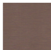
elZinc Rainbow® Red