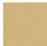
elZinc Rainbow® Gold