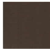
elZinc Rainbow® Brown