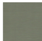
elZinc Rainbow® Green